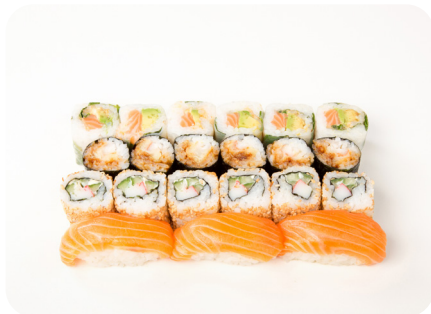
AUTUMN BOX (23.09.-22.12.)