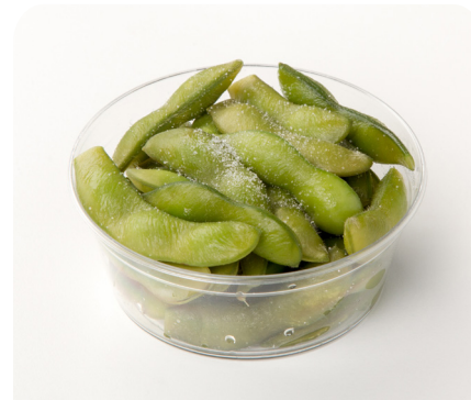
EDAMAME 3,00 € delivery price 3,10 €