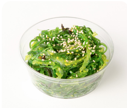
SEAWEED SALAD 3,50 € delivery price 3,60 €