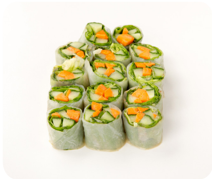
VIETNAMESE SPRING ROLLS VEGETARIAN 8,50 € delivery price 8,70 €