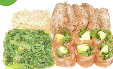
SKINNY SALMON BOX