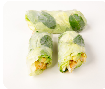
VIETNAMESE SPRING ROLLS PRAWN TEMPURA AVOCADO 8,50 € delivery price 8,70 €