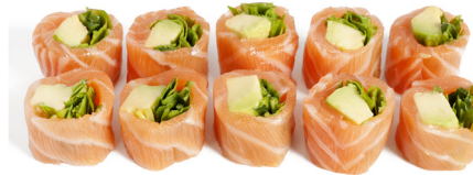
SALMON AVOCADO ROLL