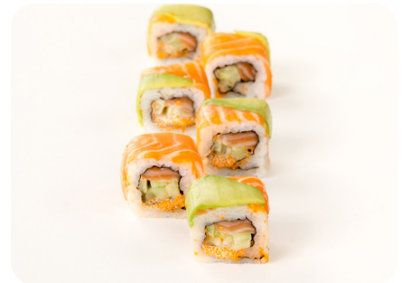
RAINBOW ROLL SALMON