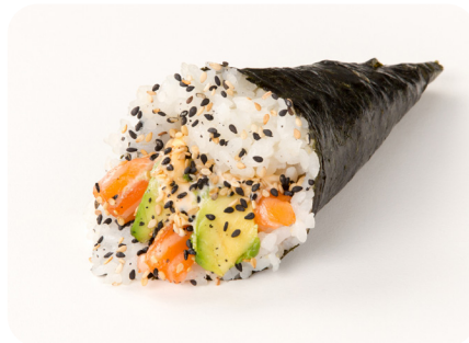
TEMAKI SALMON AVOCADO