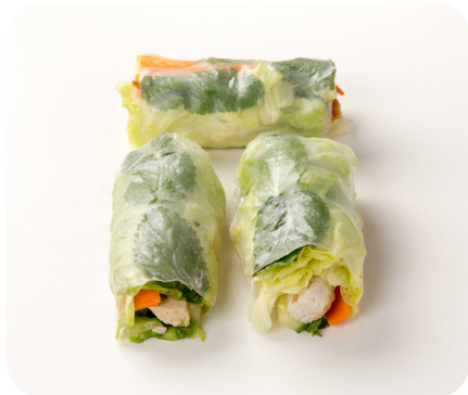
VIETNAMESE SPRING ROLLS CHICKEN 6,90 € delivery price 7,10 €