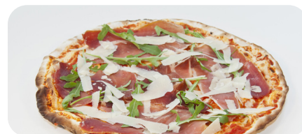
PARMA & RUCOLA