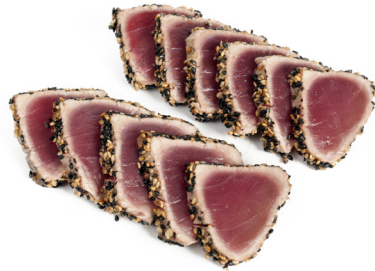
SEARED TUNA SASHIMI