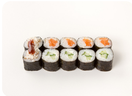
SMALL MAKI BOX