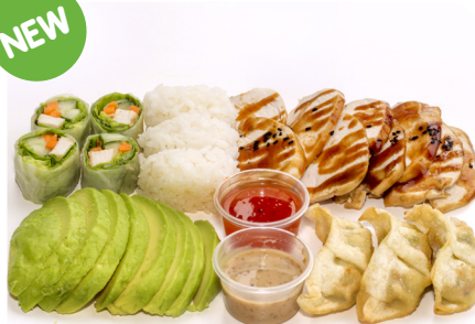
CHICKEN DELIGHT BOX