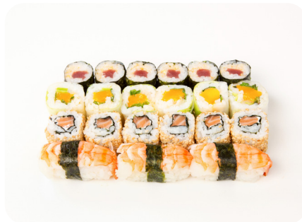
WINTER BOX (23.12.-20.03.)