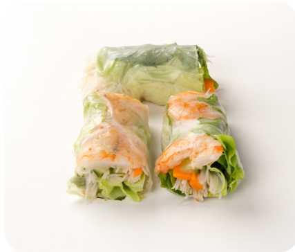
VIETNAMESE SPRING ROLLS PRAWN VERMICELLI 7,50 € delivery price 7,70 €