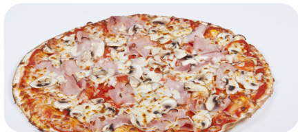
PROSCIUTTO & FUNGHI